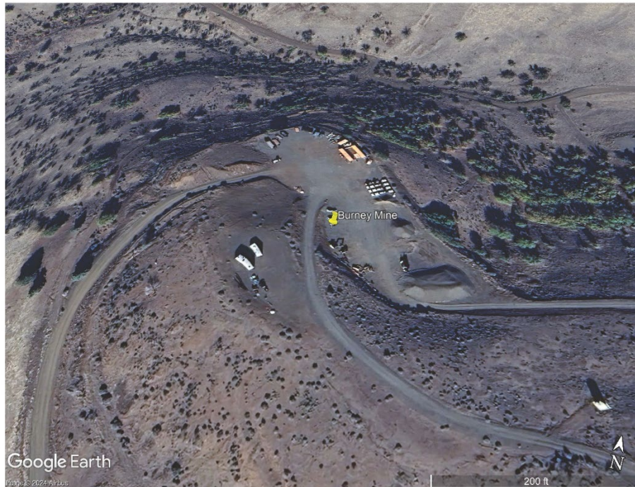
Figure 2: Klamath Ranch Quarry - Aerial Image showing existing site conditions (11/3/2023)